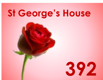
Term 5 Winners

Congratulations to the members of St Patrick's House – our Term 5 champions!